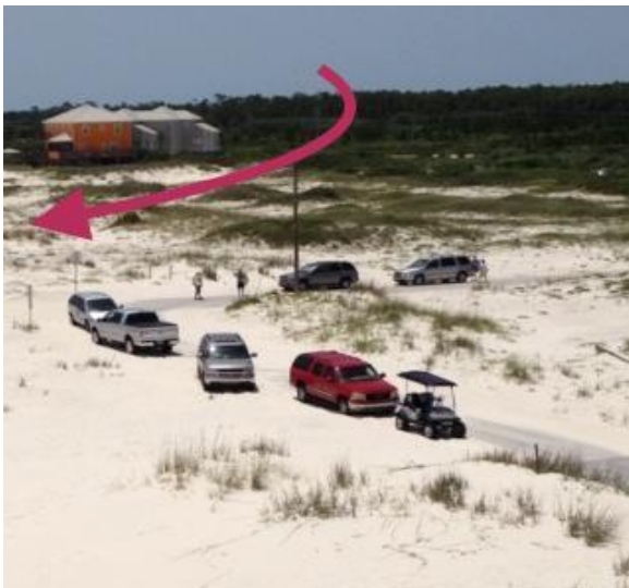
The Red Arrow shows the location for the PRD site plan and additional street being recommended for this development - at the same location where the illegal parking and traffic block Our Road.