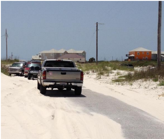
The tiny bit of cement is not a sidewalk - that is what is left of Our Road for other vehicles to use. This is typical for Our Road between Memorial Day - Labor Day.