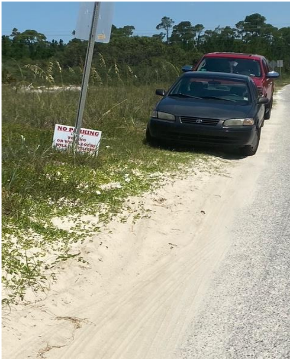
Illegal parking next to the “No parking” sign on Our Road.