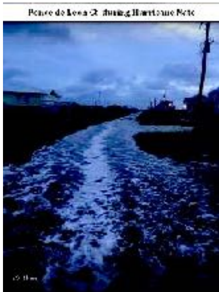
Peace de losa 2 during Hurricane Nate