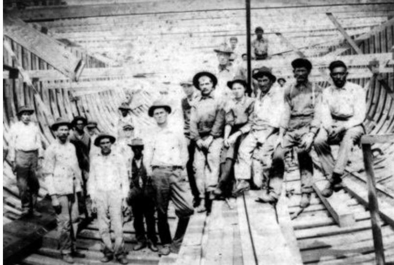
Shipbuilders at De Angelo Shipyard, Moss Point, Mississippi